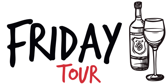
Austrian Wine Culture Experience Tour