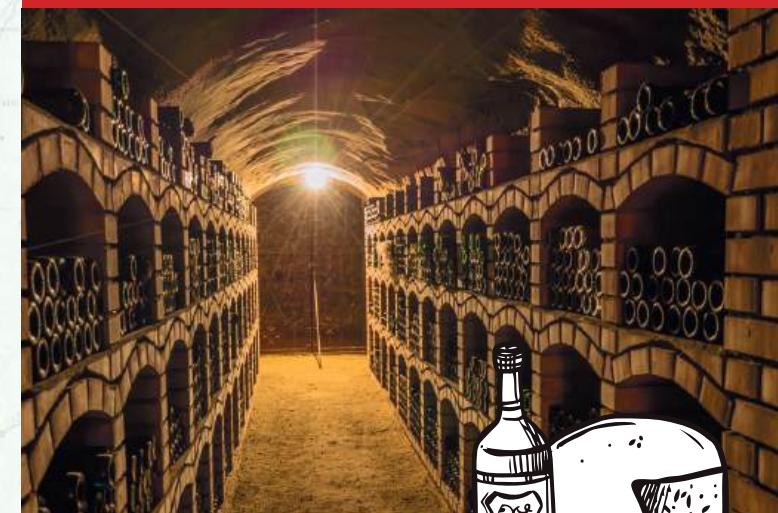
Wine Cellars, Retz