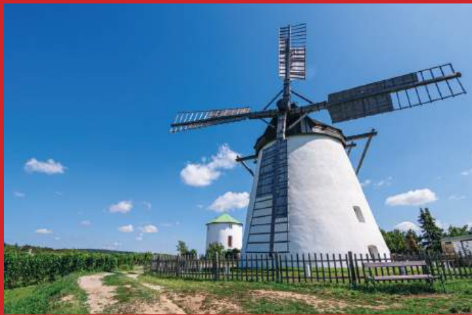
Retz windmill and vineyards