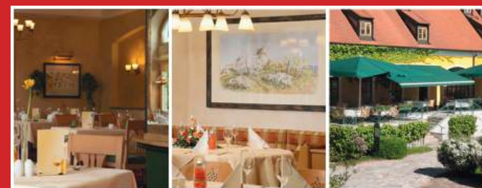
Restaurant Althof, Retz