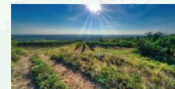
Schloss Hof Lower Austria - Landscape near Retz

Lower Austria is one of the nine states of Austria, located in the northeastern corner of the country. Major cities are Amstetten, Klosterneuburg, Krems an der Donau, Wiener Neustadt and Sankt Pölten, which has been the capital of Lower Austria since 1986, replacing Vienna, which became a separate state in 1921.