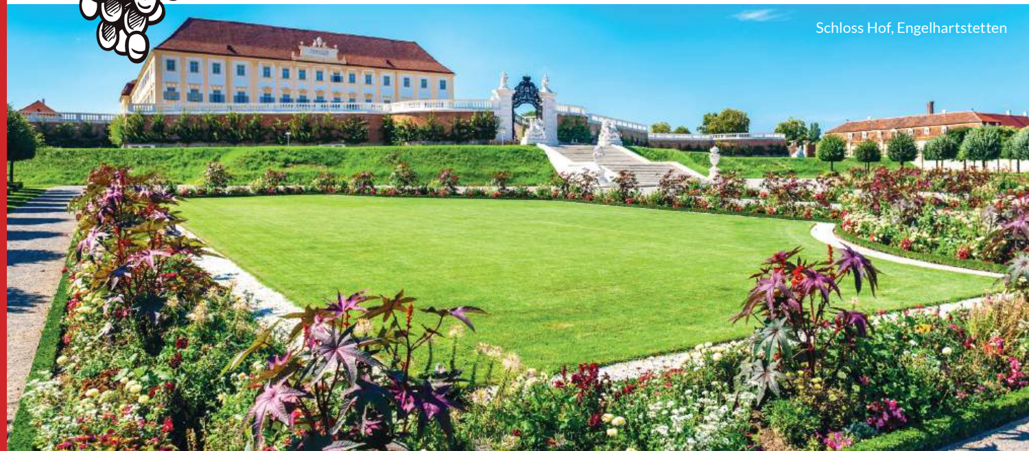
Schloss Hof, Engelhartstetten